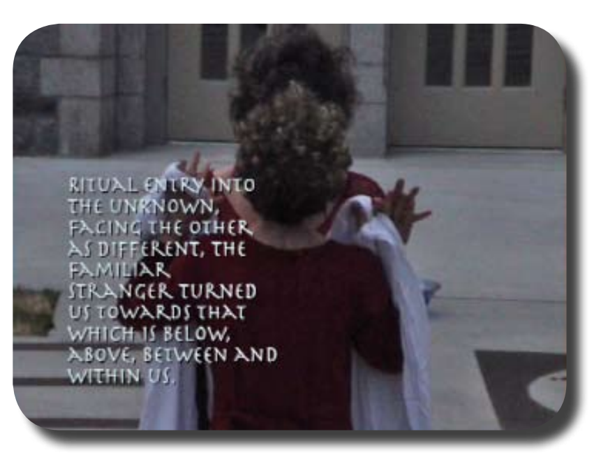
Figure 12. Figures 7, 8, 9, 10, 11 & 12: Bickel, Barbara. (2006). Re/Turning to Her performance ritual. Vancouver, BC: Vancouver School of Theology Labyrinth. Video stills.