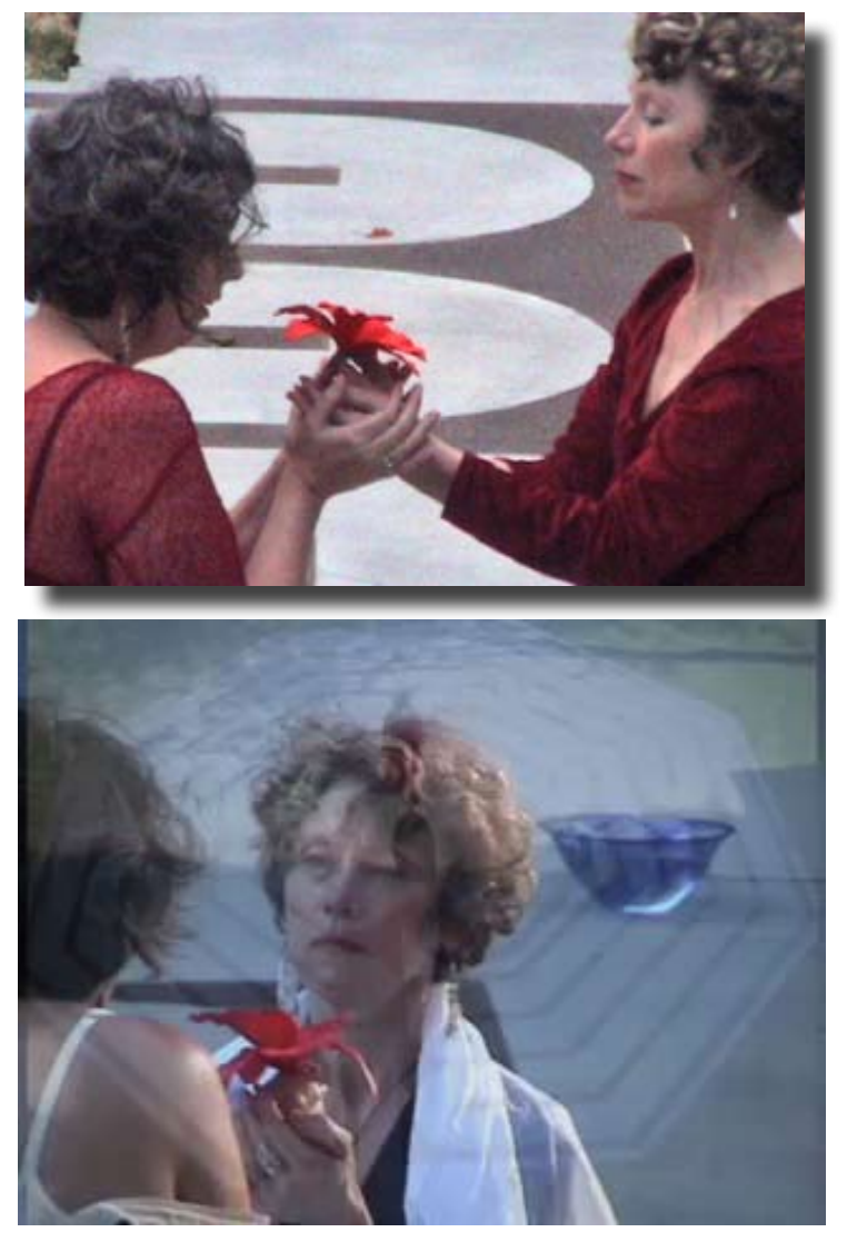
Click on the image above to see the video.

Figure 1: Bickel, Barbara. (2006). Re/Turning to Her Performance Ritual . Vancouver, BC: Vancouver School of Theology. Video stills. Click on the bottom video still to play the video documentary of the process and performance.<sup>1</sup>